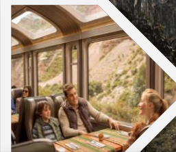
TRIP DURATION: 4 hours

At 7:00 pm, enjoy a delicious dinner at which you receive a briefing with the guide who will be responsible for the tour to Machupicchu's citadel.