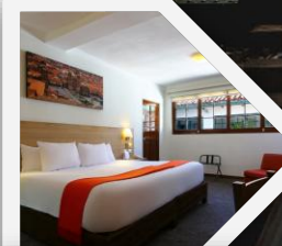
ACCOMMODATION: Comfortable Hotel