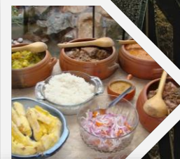
MEALS: lunch And dinner.